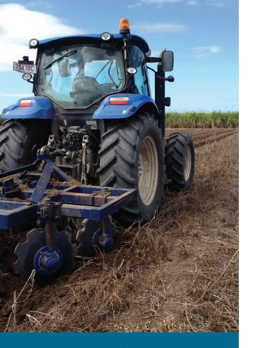
Photo above: Incorporation of stubble with a bed renovator <u>after slashing</u> and knockdown herbicide.

Photo below: Incorporation of stubble with a bed renovator after a knockdown herbicide for late planted cane.