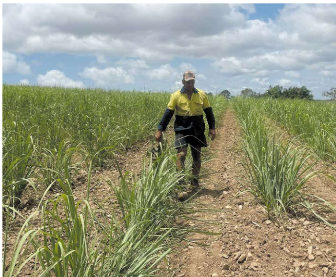
Grower walking through plant cane

There are an increasing number of “high efficiency” proprietary formulated liquid phosphate products becoming available, that resist tie up by competing with phosphate for soil absorption sites on cations such as Al, Fe, Ca, Zn and Mg within the soil, allow for lower application rates and potential loss to the environment. This article shines a light on the Nutrient Use Efficiency problem and what some of these new products can offer as part of the solution.